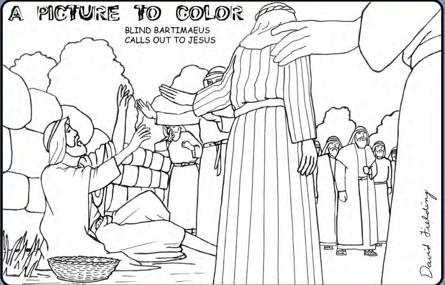
BLIND BARTIMAEUS CALLS OUT TO JESUS